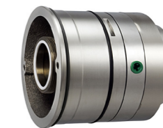
BA-ISP double seal for Scanpump PSI

pump applications. Of course these seals may also be used for any other Scanpump PSI- or Sulzer Ahlstar pump application in the mill if you prefer these customised seals over using standard seals with assembly kits.