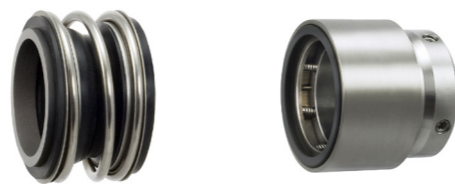
HR - Seal

mended for low duty applications and applications with low fiber concentrations where standard cartridge seals cannot be used.