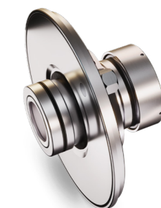
BA double seal for Valmet hydra pulper

service. The seals are offered with many different types of materials for machined parts and elastomers.