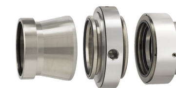
BA-AP double seal for Sulzer Ahlstar™