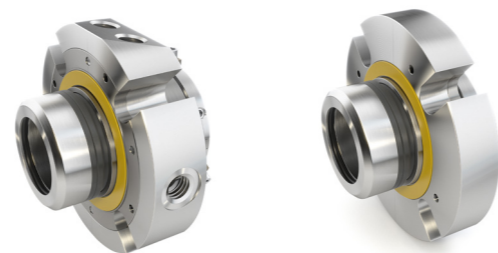
ED - double cartridge seal

Standard E-series seals may be combined with different assembly kits enabling easy fitting in most if not all of the centrifugal pumps of standard sizes used in the pulp and paper industry. Regardless of which pump brand your process is based upon, Huhnseal will engineer the necessary components for you, enabling safe and trouble-free fitting of the E-series type seals.