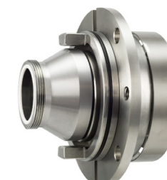
BA-BP double seal for black liquor circulation pumps

seal technology which ensures safe, reliable and economic operation of these demanding pump positions. This seal technology can be made available to most pump types and brands.